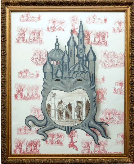
Codex Urbanus, The Question © N.Adet